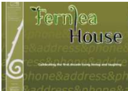
Mock-up Front cover